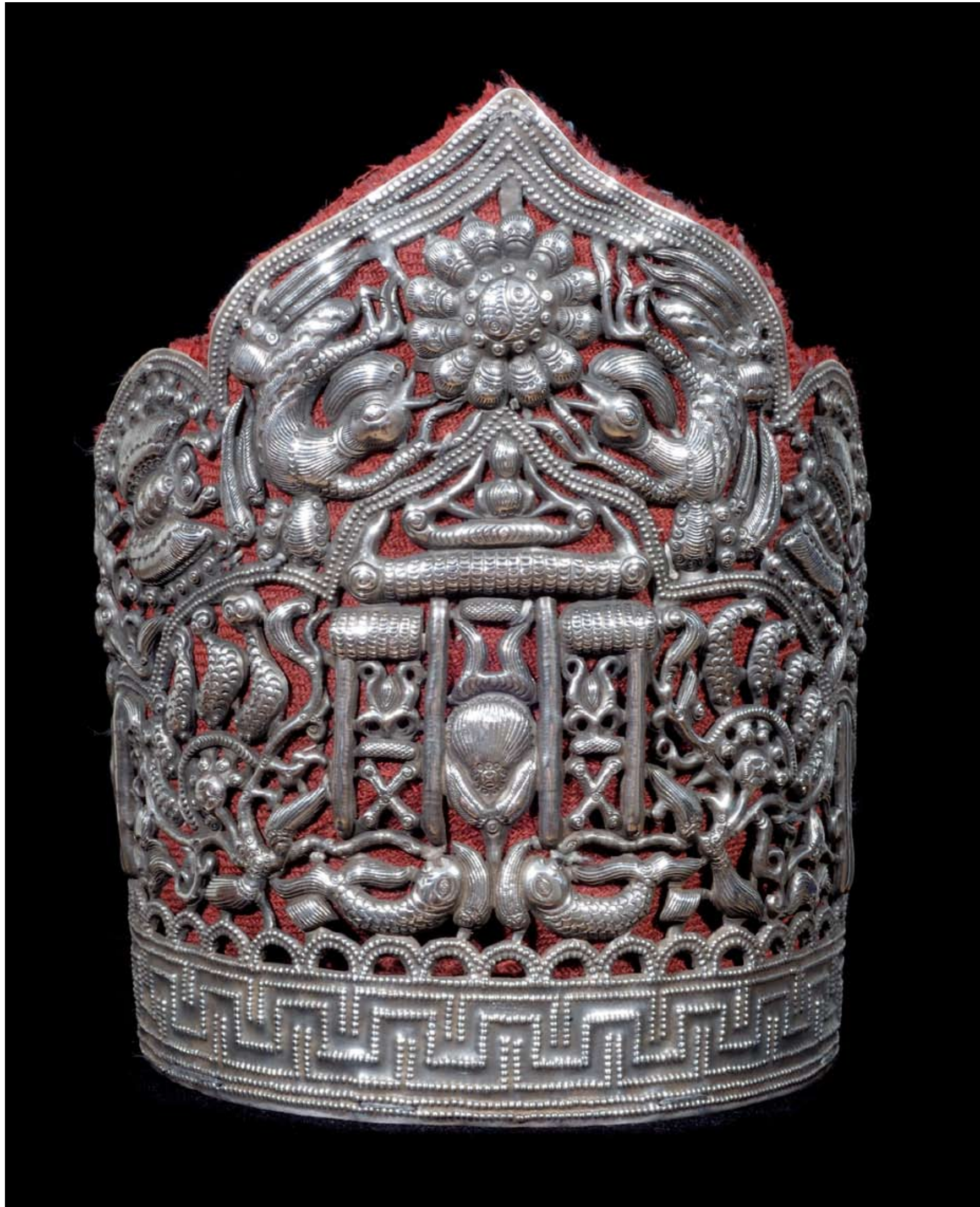
fig. 452: opposite (p. 217) Ceremonial crown for the chief dancer at a wedding, of extremely intricate and refined workmanship, displaying many auspicious motifs South-west China, Yunnan: Yi people; 19th/20th c. H 22 cm, W 16.5 cm Silver, red woollen lining