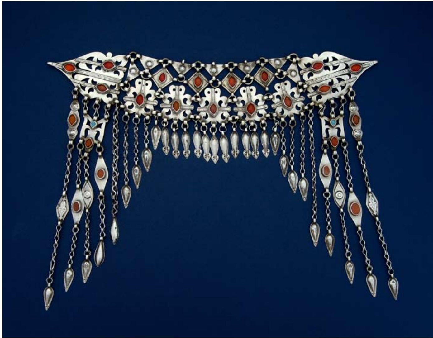
fig. 585 (pp. 344, 347) Woman's forehead ornament (ildirgitsch) featuring carnelians and two blue beads to deflect the 'evil eye' Central Asia: Turkoman people; mid 20th c. Silver, carnelians, blue glass beads H (with tassels) from 27.5 to 11 cm, W 34.5 cm