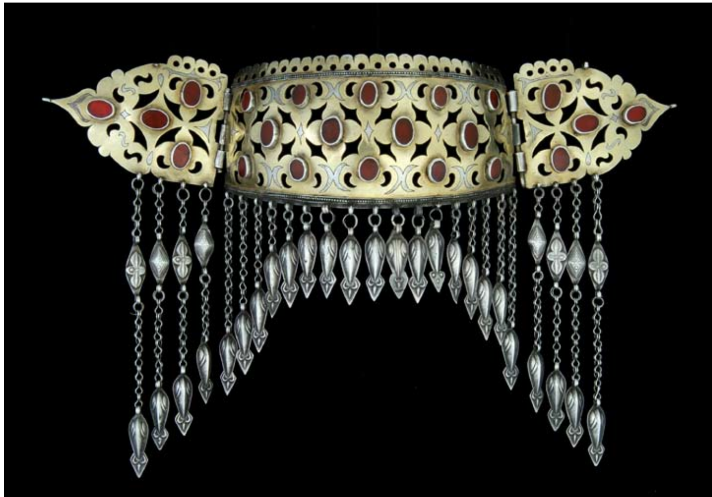
fig. 586 (p. 344) Unusual forehead ornament which combines elements of the egme and the ildirgitsch (figs 584 and 585) Central Asia: Turkoman people; early 20th c. Silver, gilding, carnelians H (with tassels) from 20 to 12.5 cm, W 34.5 cm