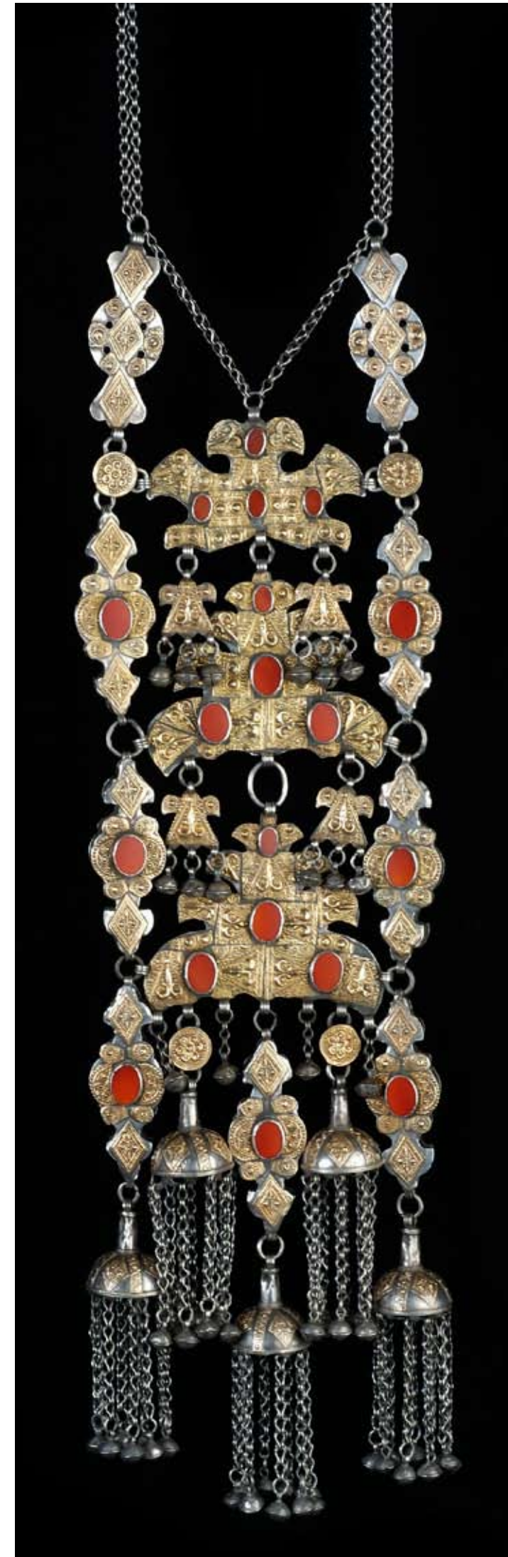
fig. 587: left (p. 344) Woman's heavy and imposing plait decoration (satschmondschuk); worn on the back Central Asia: Yomud Turkoman people; 19th/20th c. H (without chains, but with tassels) 53 cm, W 16 cm Silver, gilding, carnelians